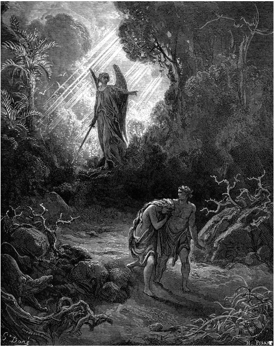
Hlang te khaw a haek coeng tih hingnah thingkung longpuei aka hung ham cherubim neh hmaitak cunghang aka tinghil te Eden dum kah kothoeng ah a khueh. Genesis 3:24